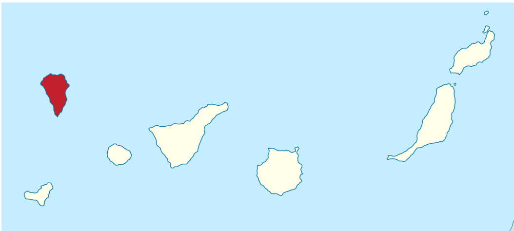
Figure 2: Map of La Palma

29 Table 1 summarises the eruptions recorded since the colonization of the islands by 30 Europeans in the late 1400s.